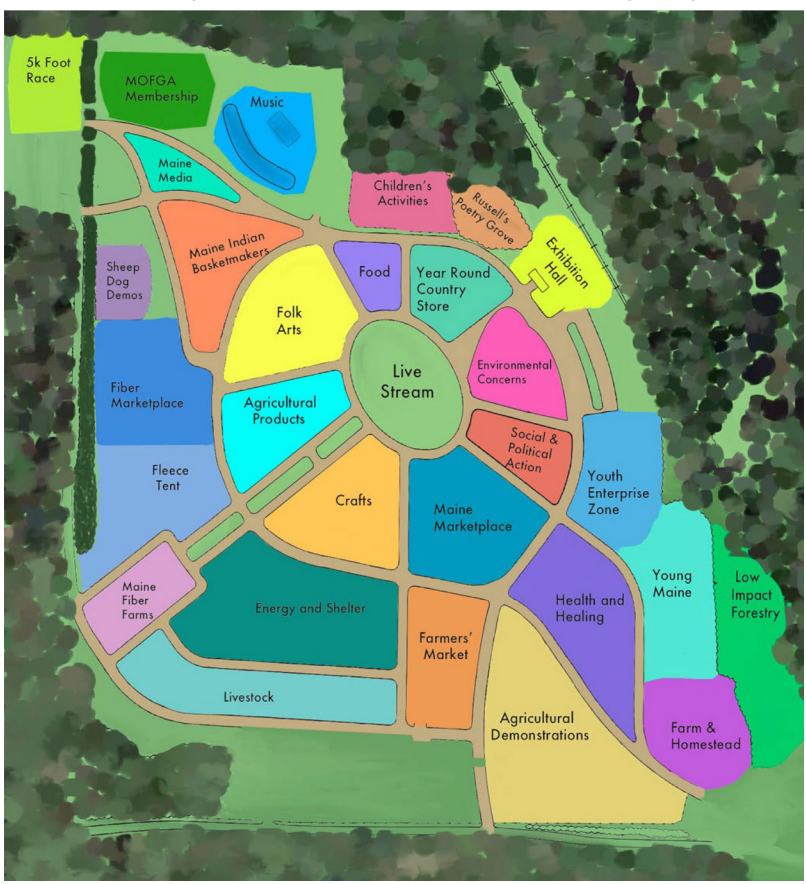
Common Ground offers a map for virtual viewers to use to find areas of interest - still available at www.fair.mofga.org

The Maine Organic Farmers & Gardener's Common Ground Fair, with headquarters in Unity, Maine, designed, created and presented a Virtual Agricultural Fair on September 25, 26 and 27. "Celebrating Rural Living at Home" was their slogan. Throughout the three days of the fair, music and diverse workshops focusing on organic farming techniques were live streamed. Great news - these workshops continue to be available for viewing on their website at www.fair.mofga.org!