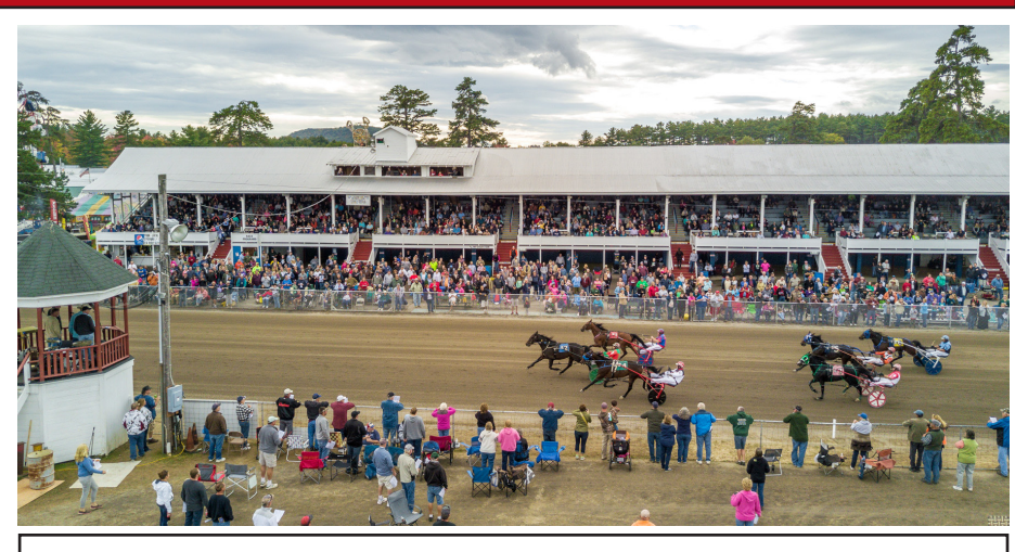
Fryeburg's Virtual Fair continues to be available for viewing on their website www.fryeburgfair.org & Facebook page!

A few of us attended a webinar about virtual fairs and began researching how this could work. The webinar was sponsored by the IAFE, and Clay County Agricultural Fair in Florida who had conducted a virtual fair event themselves. We attended several other online meetings and seminars about virtual events before going forward.